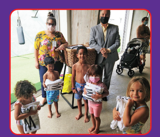
Thank you to West Boca Medical Center who provided financial assistance scholarships for swim lessons during Safety Around the Water week.