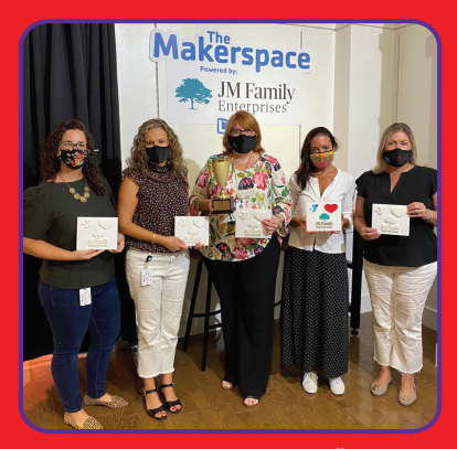
THE LAB showed off new "tech toys including 3D printers offered in their Makerspace, generously sponsored by JM Family Enterprises. JM staff came out to experience first hand what their sponsorship made available.