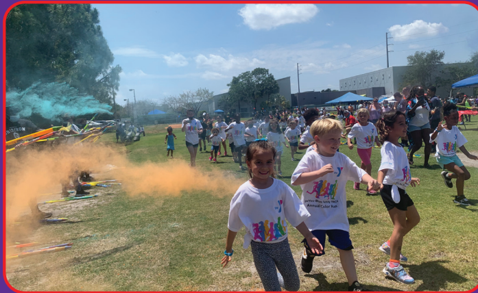
Kids had a BLAST participating in the Boynton Y's Color Fun Run, sponsored by AfterHours Pediatrics at Healthy Kids Day!