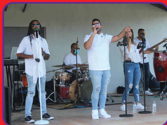
Los Mompirris band energized the crowd at Baila Connigo .