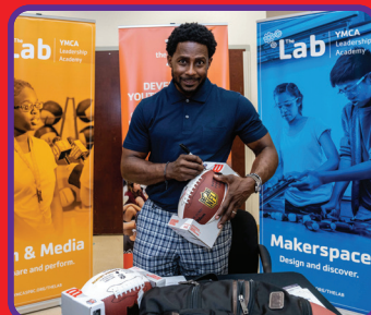
Desmond Howard , Heisman Trophy winner and on-air ESPN personality, energized the crowd at our 19th Annual Inspiration Breakfast.