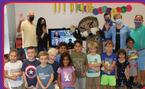
Rotary Club Downtown Boca Raton visited the Boca Y preschool to read them a story about Water Safety .