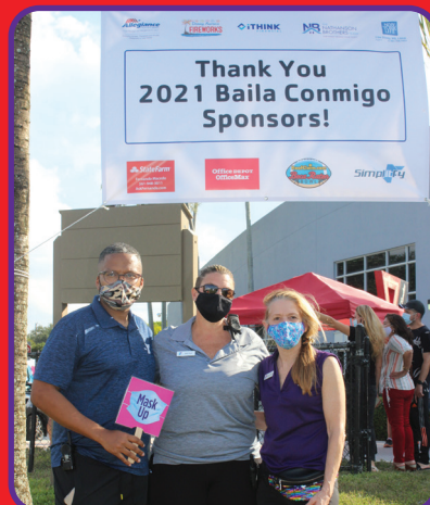
Thank you to all of our Baila Connigo sponsors who helped make this event a HUGE success!