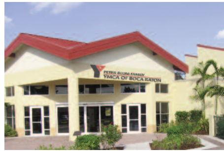
Peter Blum Family YMCA of Boca Raton

Working parents who have school-aged children will feel confident that the YMCA provides summer day camp when school is not in session. In all camp programs, a strong emphasis is placed on building character, teamwork and self-improvement.