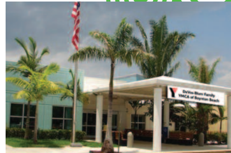
DeVos-Blum Family YMCA of Boynton Beach